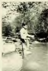
"Anyway, the suckers bite!"