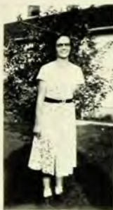
"Lionstey is a wonderful sailboat!"