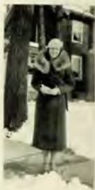
"We've got some in our cellar, too!"