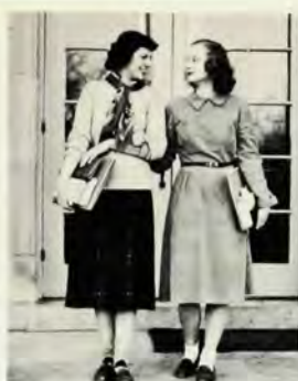
Wass Best friends