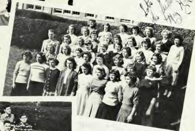
FRESHMAN GIRLS' CHORUS

Lots of info in the yellow pages. My Hymns