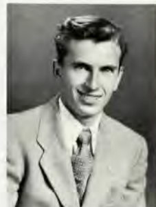
JOHN WILLIAM TURNER

"To draw, to sketch, to paint is my delight."