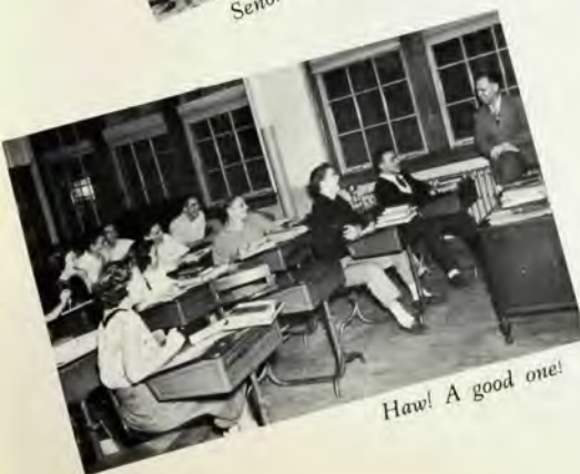
Haw! A good one!