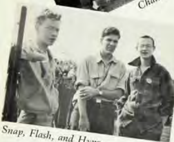
Snap, Flash, and Hypo