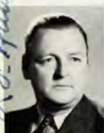
Louis Haar Music