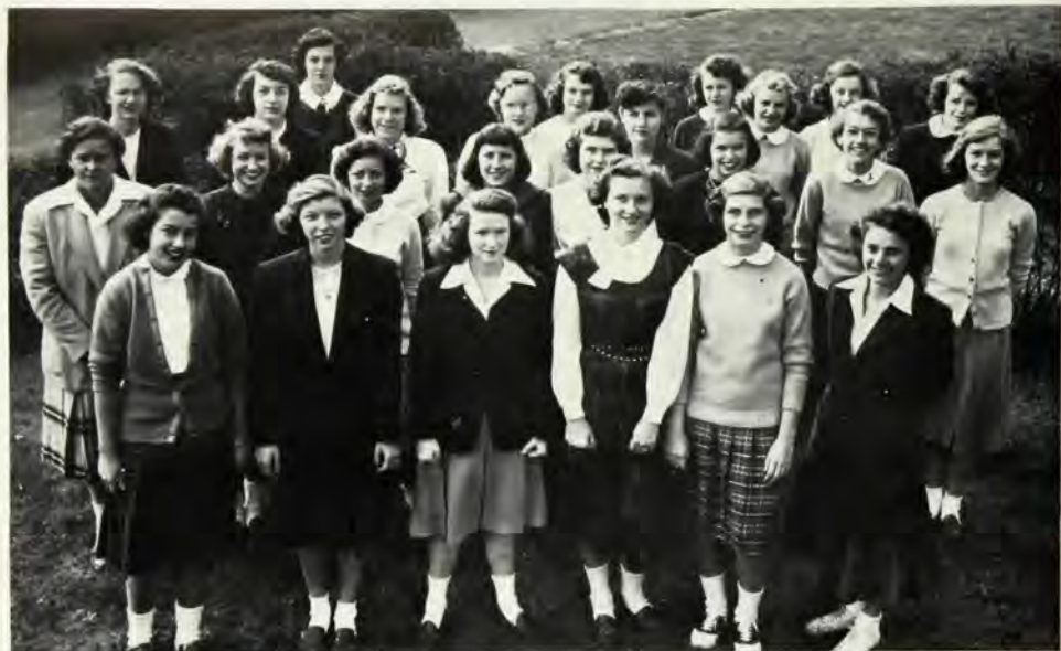
THE G.A.A. COUNCIL