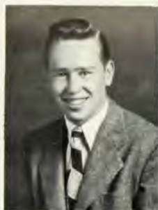
DAVID E. YARROW "Salty"

"A man that blushes is not quite a brute."