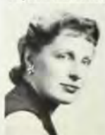
Greta Weirsmar Art