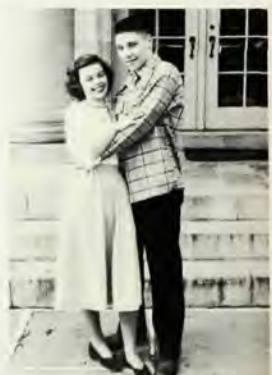
Romeo and Juliet