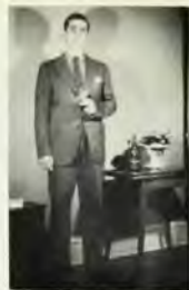
Man of distinction