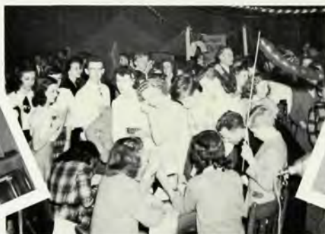
Four Leaf Clover Frolic