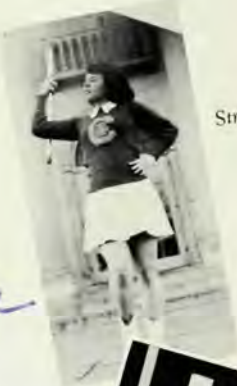
Struttin' her stuff