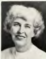
Edna Peairs Art