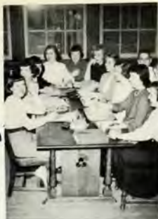
"Well, I heard . . .!"