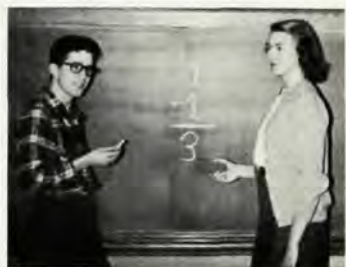
Jamieson Class brains Burelbach