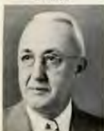
Harold Wilson Science