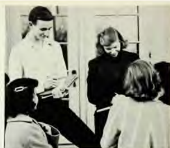
Most popular and Best-all-around Catts