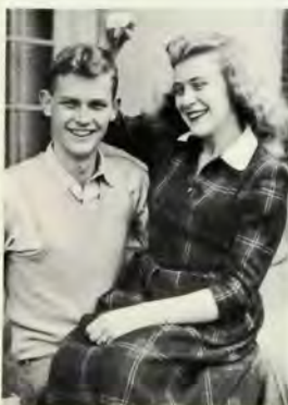
Swanholm Prettiest hair