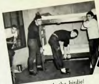
Watch the birdie!