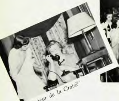
"Monsieur de la Croix?"