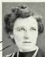
Hazel Kingsbury Home Arts