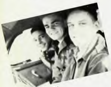
The Big Three