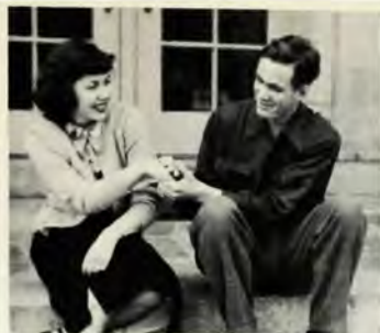
Di Spirito Blushers Glovier