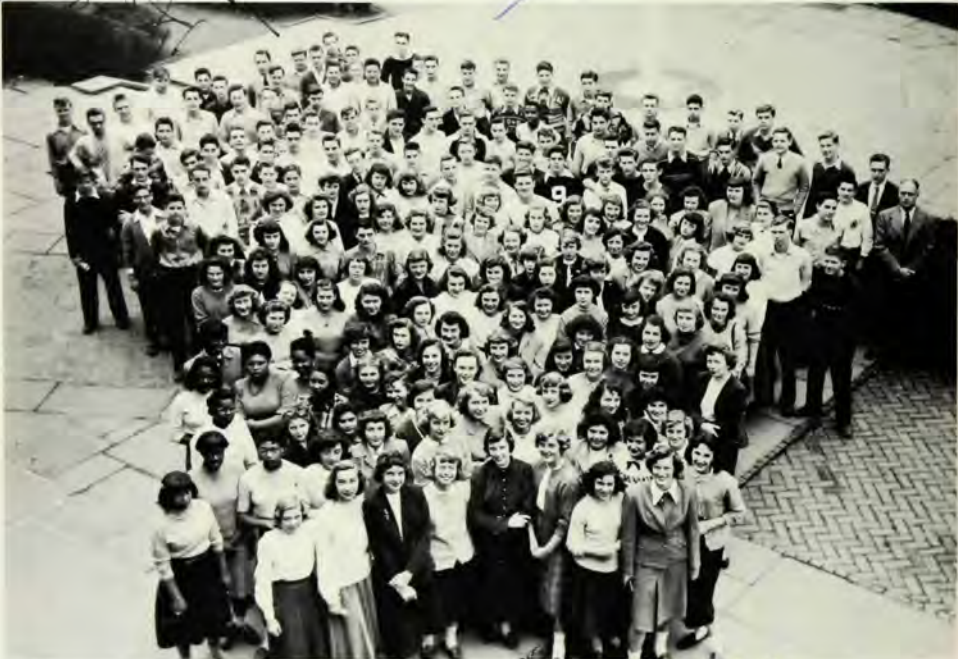
Best of Luck From '50"