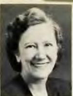
Margaret Byrnes Health