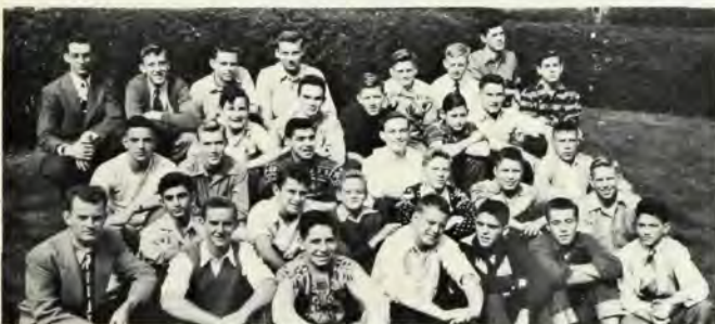
BOYS' GLEE CLUB