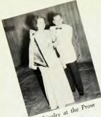
Chivalry at the Prom