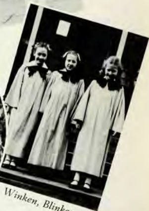
Winken, Blinken, and Nod