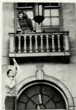
Class actor and actress