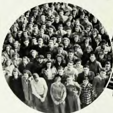
My, weren't we handsome!