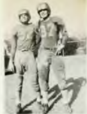
Rough and ready