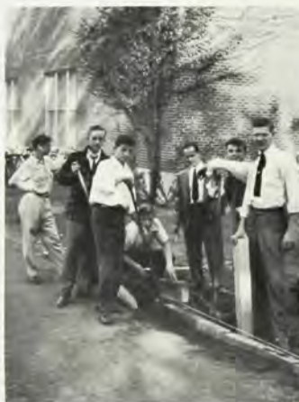
On the job