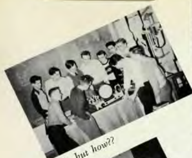
Yeh, but how??