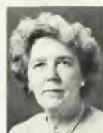
Adelaide Mifflin Social Studies