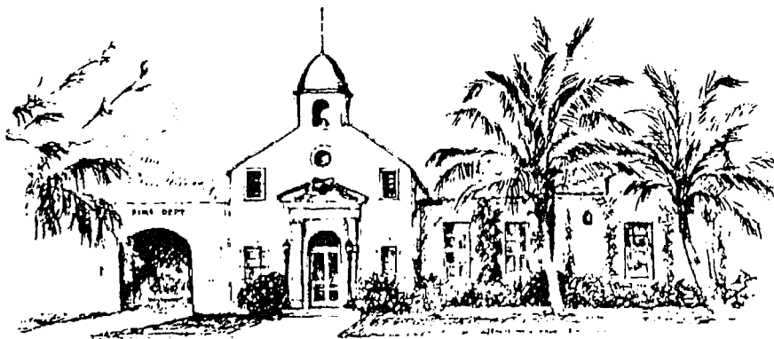
OLD CITY HALL, HOME OF BOCA RATON HISTORICAL SOCIETY