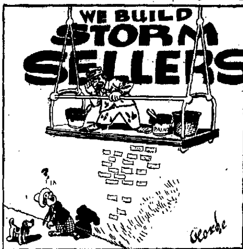
"OK, wise guy, how DO you spell it?"