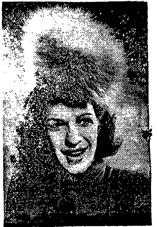
NANCY WALKER, noted Broadway comedienne, who will appear in Cole Porter's famous musical, "Anything Goes", at the Princeton Drama Festival, McCarter Theatre, Princeton, one week starting Monday.

The War of the Roses was so called because the emblem of the House of Lancaster was a red rose and that of the House of York was a white rose.