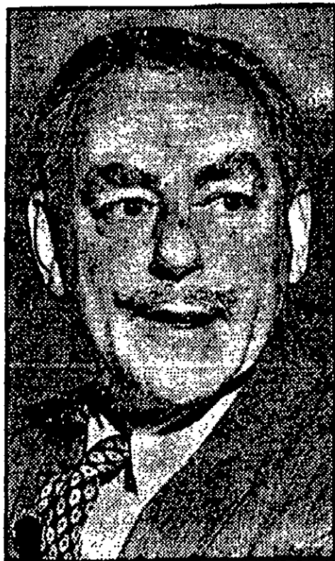
Dean G. Acheson