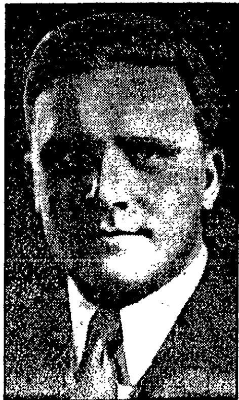
James E. Webb

Dean G. Acheson has been appointed secretary of state to succeed Gen. George C. Marshall, who resigned because of ill health. Acheson, 55, is a lawyer and former government official, having previously last served as undersecretary to General Marshall. James E. Webb, 42, formerly director of the budget, has been named undersecretary of state, succeeding Robert A. Lovett, who also resigned.