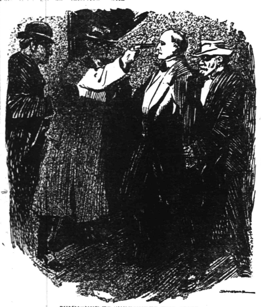
SUMMONED TO SURRENDER THE KEYS