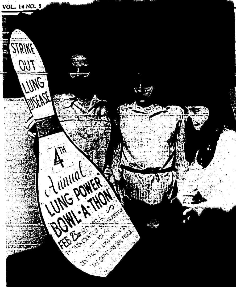
STANDING OUT...The Union County Junior Bowling Assn.'s Fourth Annual "Lung Power Bowling-A-Thon" took place at the Clark Bowling Center on Tuesday night. The event was held to raise funds for the Lung Cancer Research Fund. In the foreground, a sign reads "4th Annual Lung Power Bowling-A-Thon".