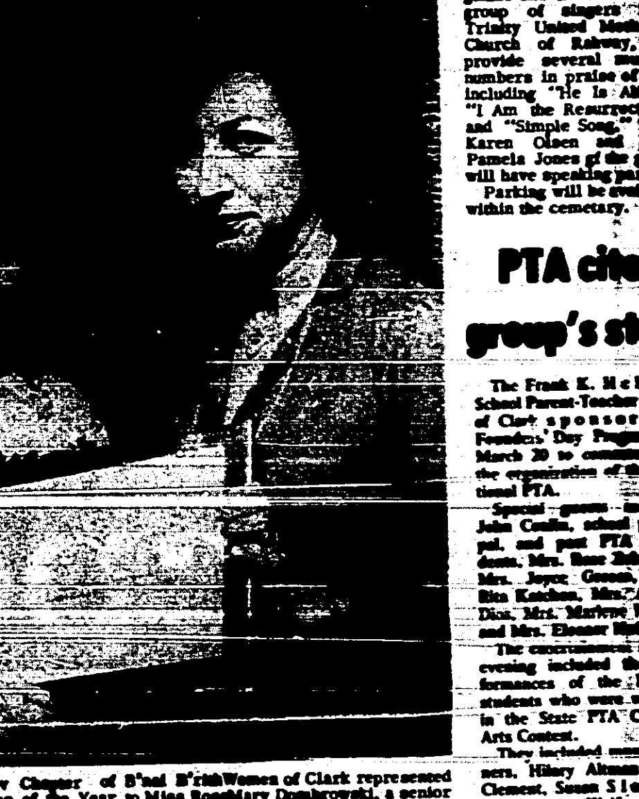
PTA club group's start... The PTA club will hold its first meeting on Thursday, April 2, at 7 p.m.