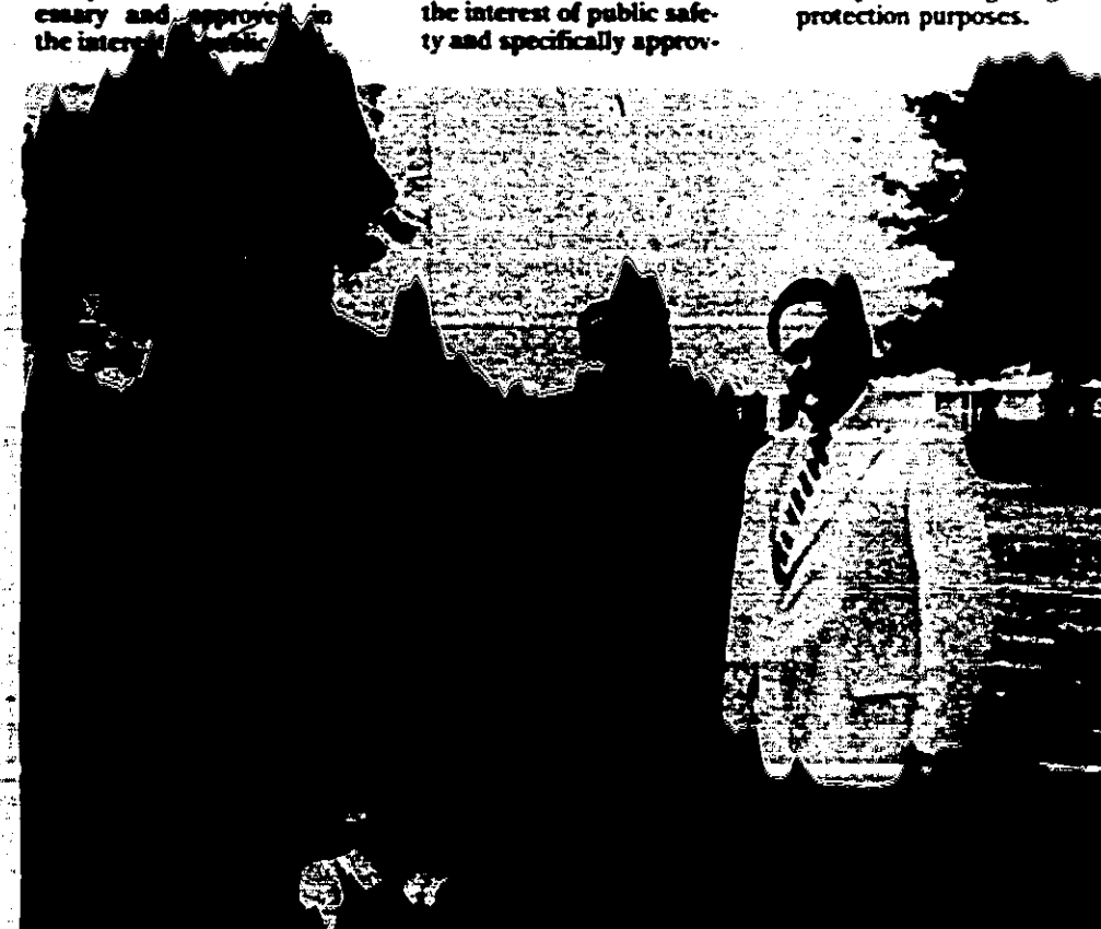
Members of the Clark Township Fire Department are shown here. They are standing in front of the fire station. The fire station is located on Terminal Ave. in Clark, N.J.

Because of the prolonged drought conditions in the northwestern part of the state, New Jersey Gov. Brendan T. Byrne has placed water restrictions on municipalities in the state. The restrictions will be in effect until the end of the year. The restrictions will be in effect until the end of the year. The restrictions will be in effect until the end of the year. The restrictions will be in effect until the end of the year.