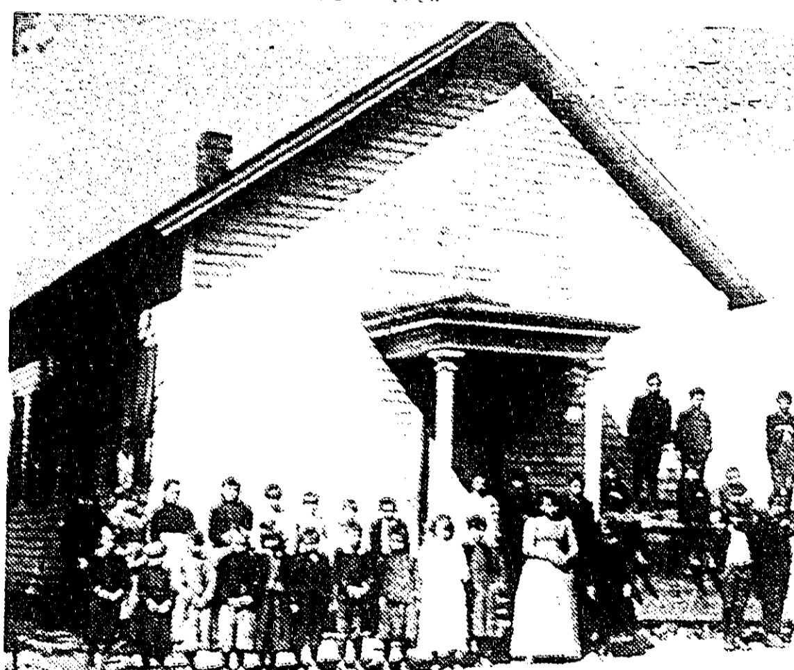
CALL TO CLASS: Pupils and a teacher stand in front of the Scudder Schoolhouse at Raritan Rd. and Central Ave. Clark, in the days when the building was the township's only school. The schoolhouse, erected in 1818, was a private institution until 1861 when it became part of the Raritan school system. In 1864 when Clark became a municipality, it was the township's only school and it remained in use to the 1911-1912 school year. It was replaced by a two-room brick school building.