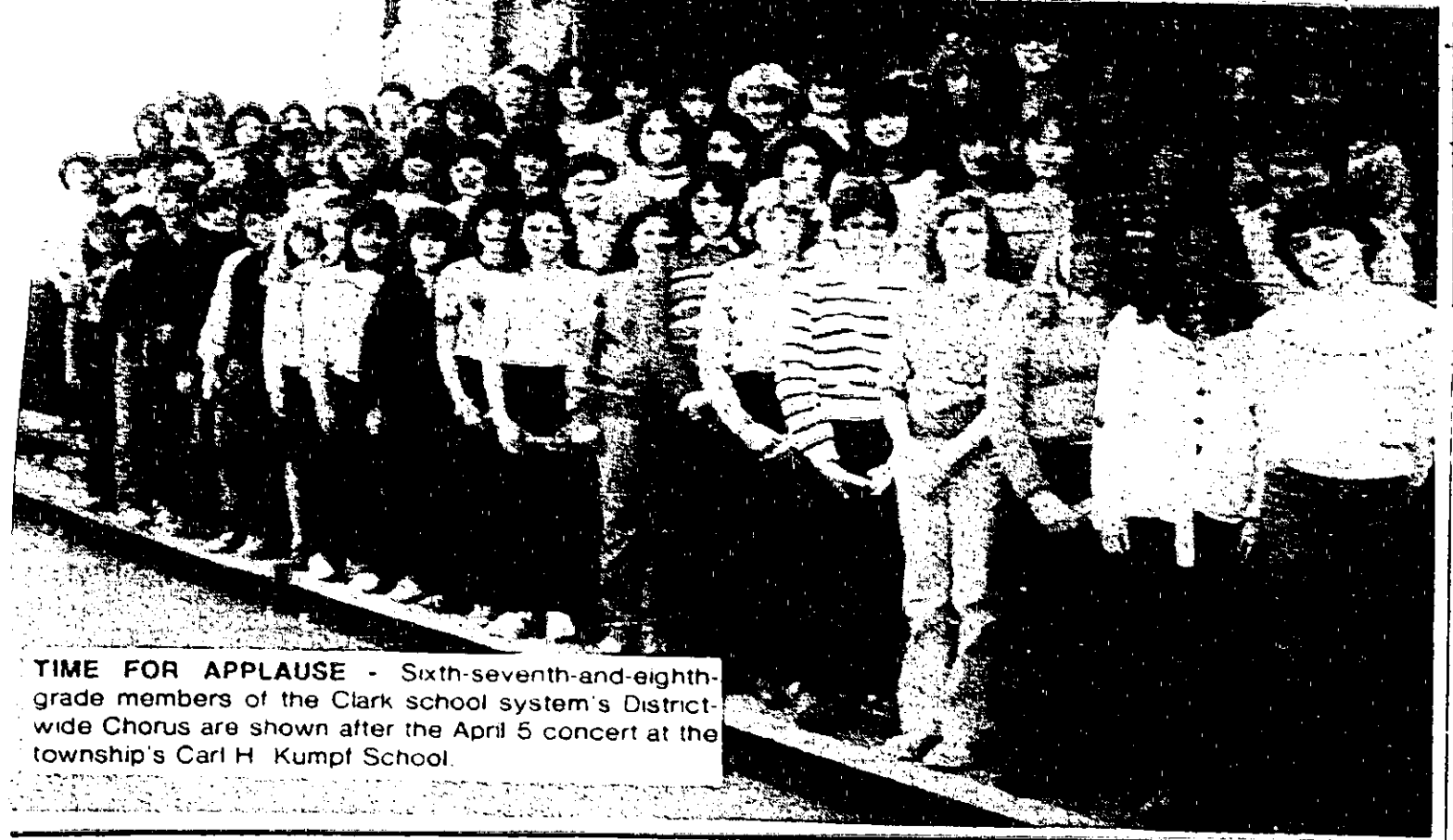
TIME FOR APPLAUSE - Sixth-seventh-and-eighth-grade members of the Clark school system's District-wide Chorus are shown after the April 5 concert at the township's Carl H. Kumpf School.