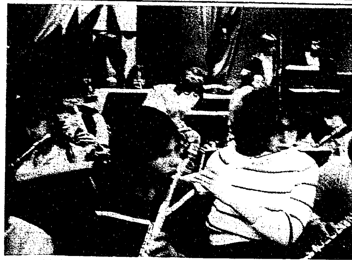
VIRTUOSOS - The Clark District-wide Chorus and Band gave their concert on April 5 at the township's Carl H. Kumpf School. The students were under the direction of the Clark music staff. (Please see other pictures inside.)