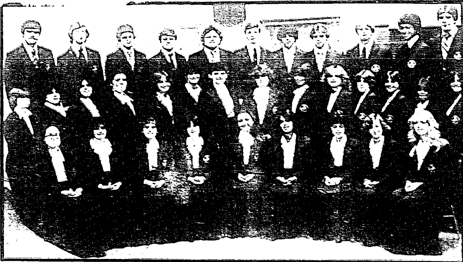
INTERNATIONAL STARS - The Bel Canto choir, in the photo, sang at the annual International Stars Festival in Canada, where they won unanimous high praise from the judges.