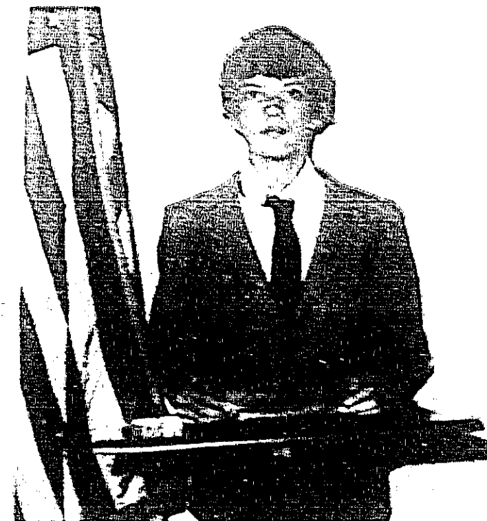
the student welcoming address at graduation by the Brewe Kinck Band incredit to

radicipate in the pris List in the heriefficially should lak la copy of their award. ic commission lake their next ricus is wherever their canking sidone. Tell the rganization they want to sign up for Direct Deposit The financial organization in the fill out the recessed of forms little that case and convenient We are not the secondary's of date the thenefold a night up, the have its will begin going. I to the recipient's to a checking or savis according to