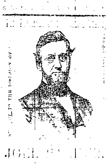
JOEL P. ...

Vertical text column on the left side of the page, containing various news items and advertisements.