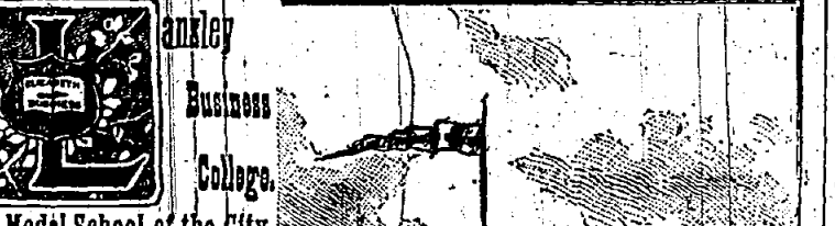
The Model School of the City.

For constipation, biliousness, indigestion, headache, neuralgia, etc.