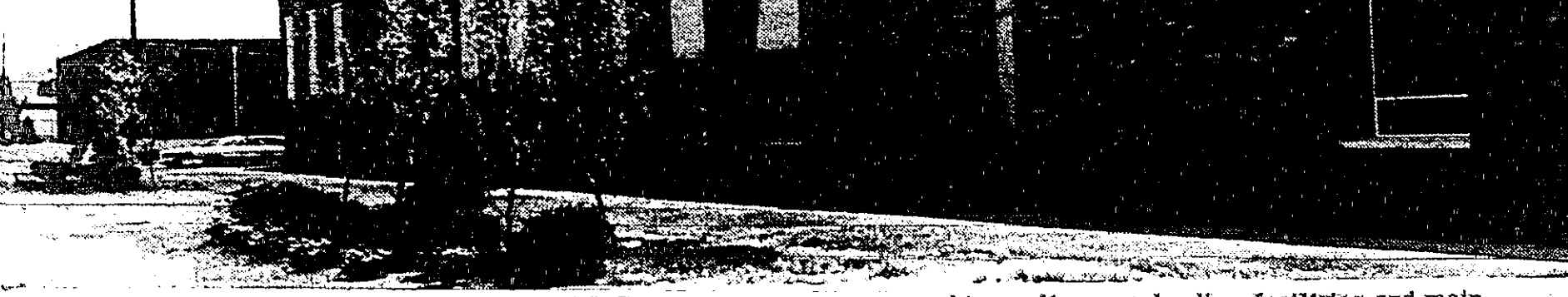
SOMETHING NEW... Rahway Industrial Center, a "garden apartment" for industrial tenants, is now under construction. The new center, which is being developed by American Construction Company of Iselin, will consist of a four-story building, off-street parking, off-street loading facilities and maintenance of the landscaped grounds. Leslie Blum Company, Newark real estate agent, is broker for the new center, which is being developed by American Construction Company of Iselin.