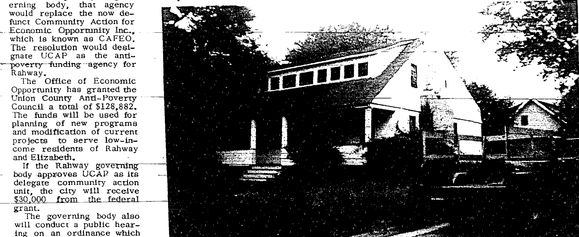
OLD HOME RAZED... This Colonial style dwelling stood at 896 Main St., Rahway, which is at the corner of E. Stearns and Main Streets, until it was demolished to make way for three new houses being constructed by Suncrest Homes Inc., 1608 Irving Street.