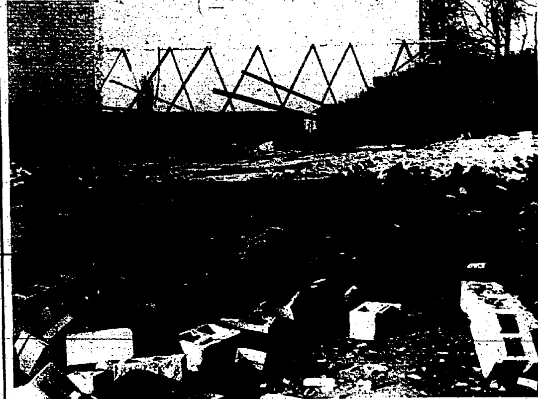
At the ShopRite Superstore construction site in Clark, a mass of destruction lies in the wake of Saturday's wind and rain storm which caused a 300 foot section of wall to collapse.