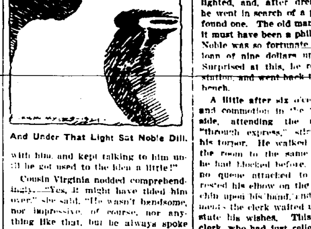
Illustration of a man in a suit.