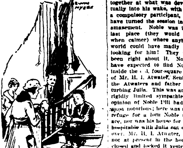
Illustration of a man in a suit.