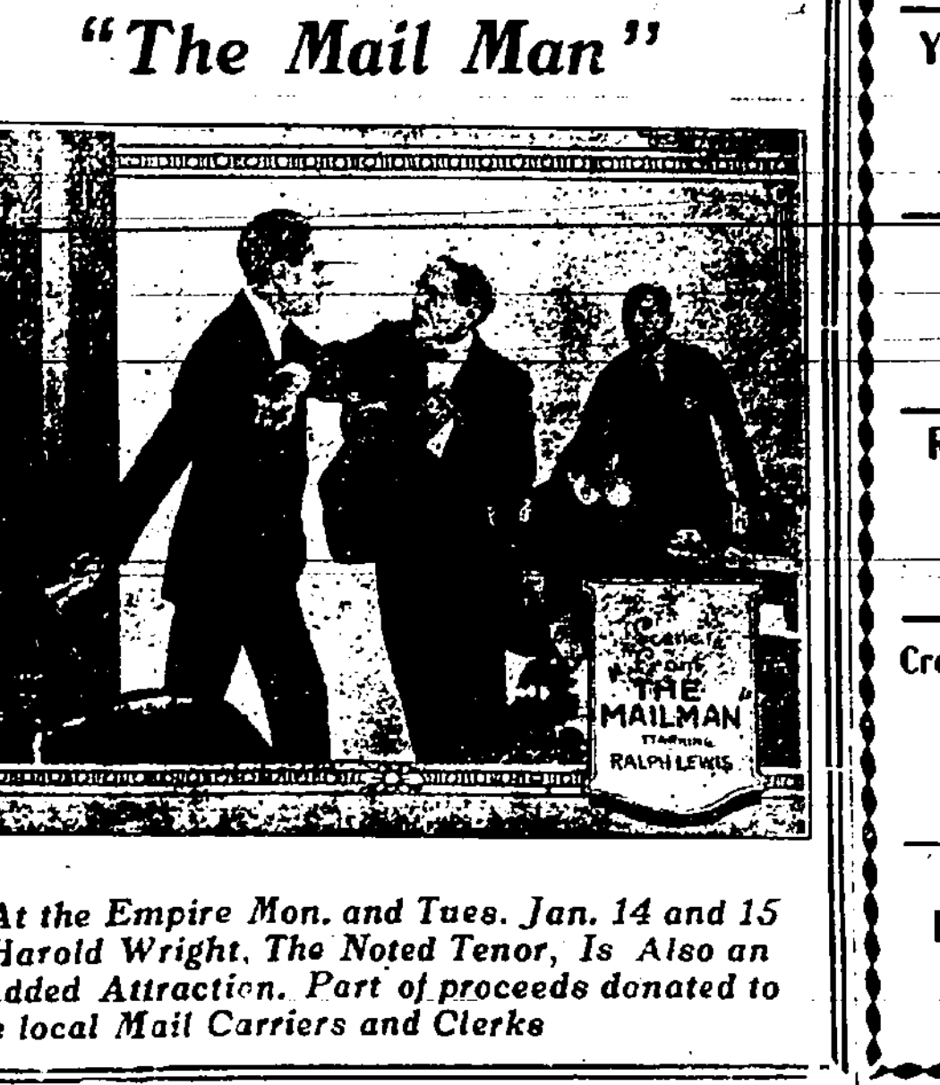
'The Mail Man' advertisement text.