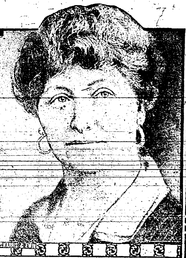
Portrait of a woman, likely the new Civil Service Board member.