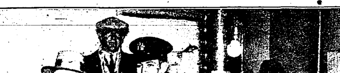
COPS POSE WITH TROPHY OF YESTERDAY'S RAID

RAHWAY, UNION COUNTY, N. J., FRIDAY AFTERNOON, JANUARY 13, 1928