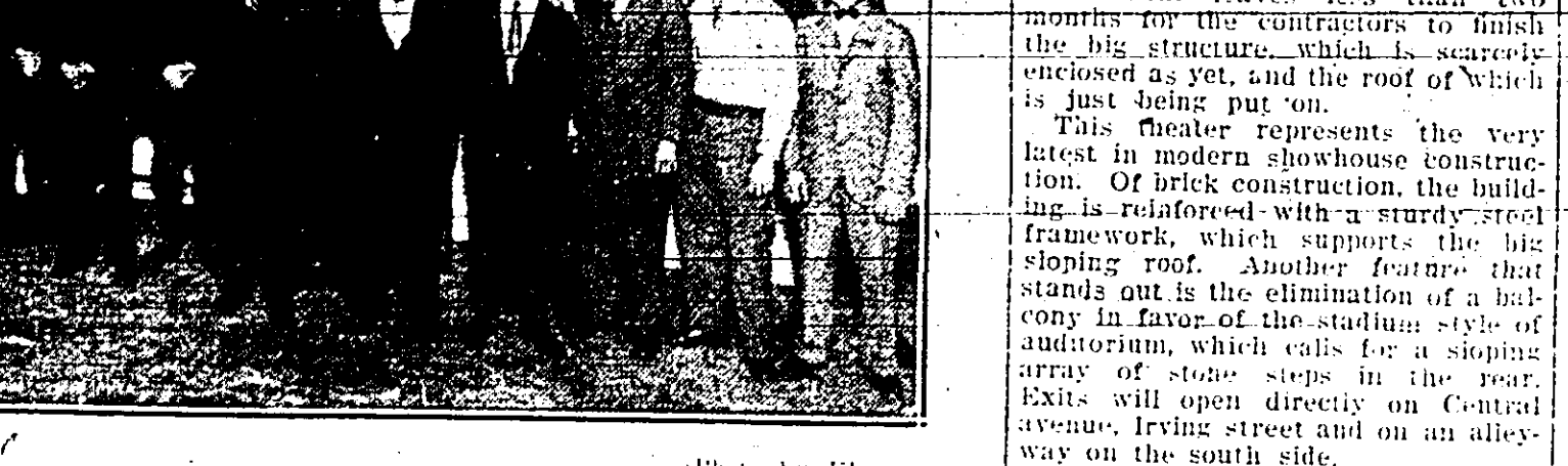
MODEL HOUSE BUILT BY CARPENTRY APPRENTICES

RAHWAY, UNION COUNTY, N. J., TUESDAY AFTERNOON, JANUARY 31, 1923... The Railway Record is a publication for the railway community in Rahway, New Jersey.