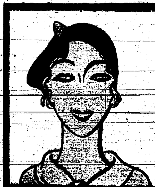
Marie Alphonsine uses cheville for a tiny little model with its brim wired out at one side. Original, 39.75. Bamberger reproduction . . . 16.75