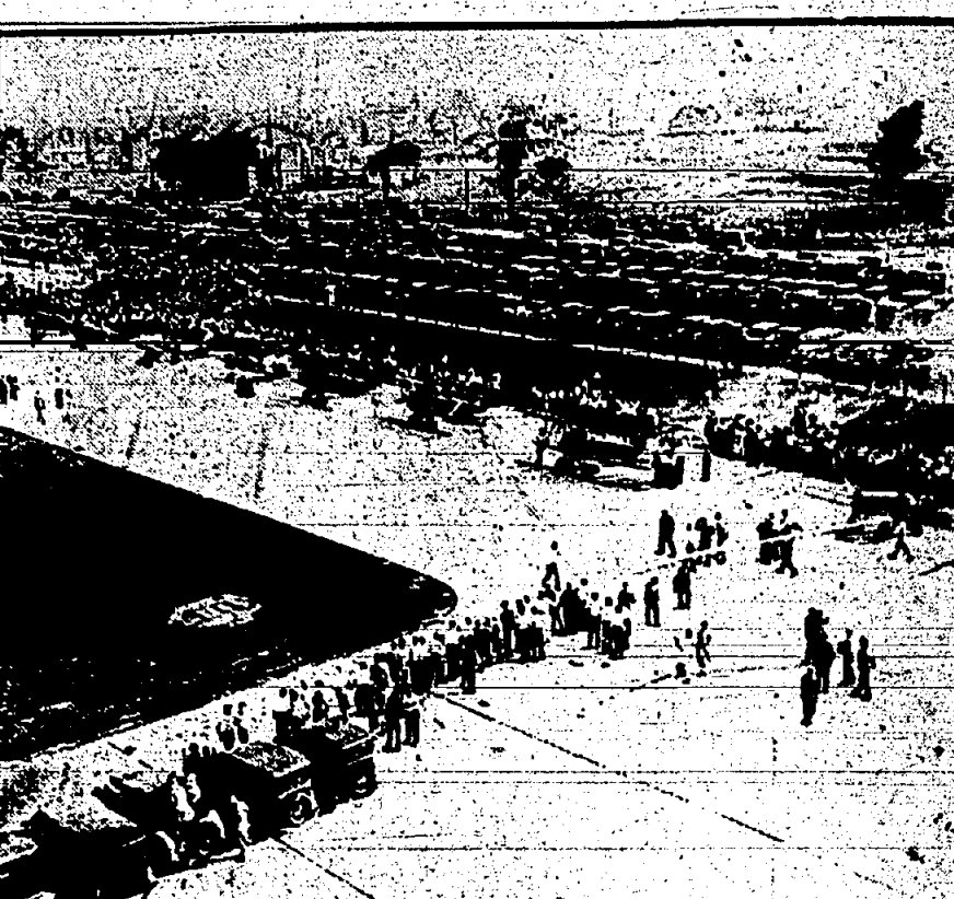
Scene at City Airport, Detroit, Mich., as a dozen planes prepared to dash off on the first day of the All-American Flying Derby.