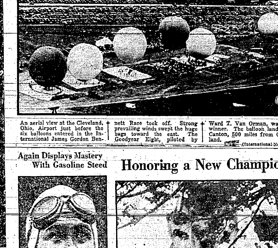
An aerial view of the Cleveland, Ohio, Airport, just before the U. S. balloons entered in the International Race. The balloons were launched at 10:00 a. m. and landed at 1:00 p. m. The race was won by the U. S. balloon, which landed at 1:00 p. m. The race was won by the U. S. balloon, which landed at 1:00 p. m.