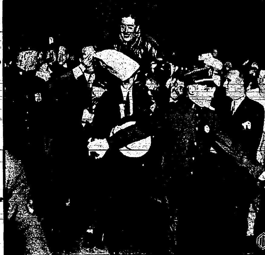
Dieudonne Coste being carried aloft on the shoulders of admirers after he landed at Car...