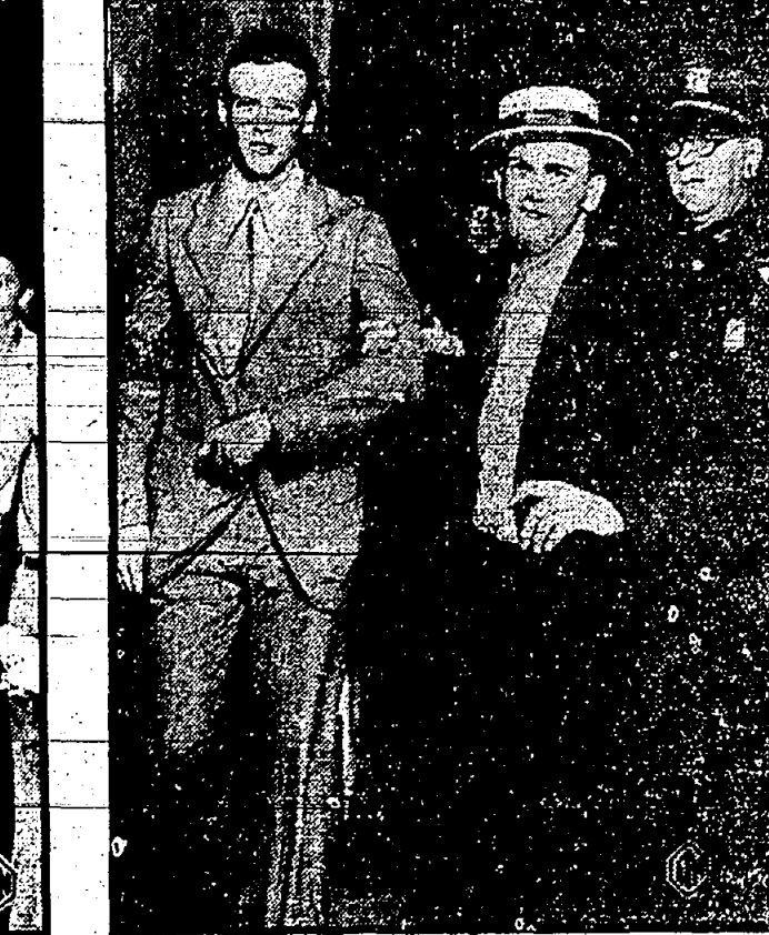
Col. Charles A. Lindbergh left the field house at Curtiss Airport after extending a warm welcome to Dieudonne Coste and Maurice Bejot, the two Frenchmen who, for the first time in history, made a non-stop flight from Europe to this country.