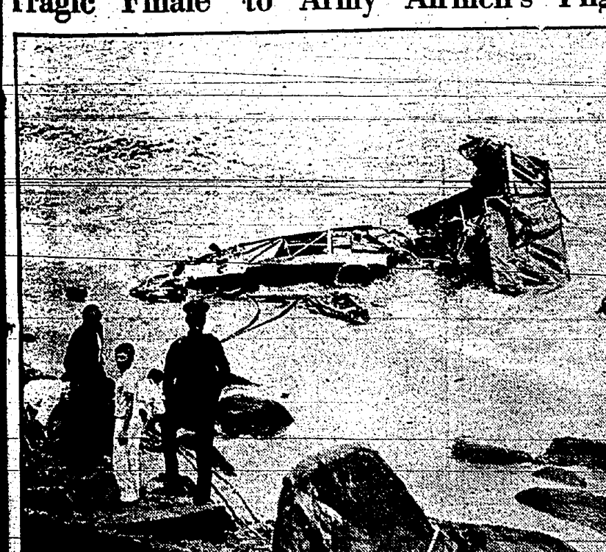
Chutes spectators gather on the beach at Highland, N. J., to watch the final flight of the Army airmen. The flight was made on September 4, 1930, and was the last of a series of flights made by the Army airmen.