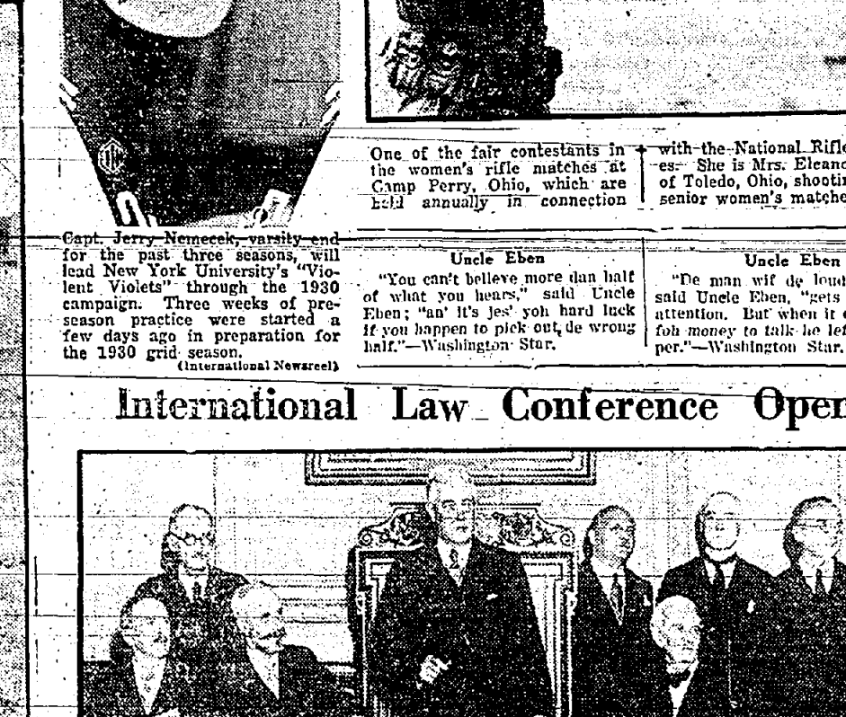
Scene at the opening session of the International Law Association, which is being held at the Waldorf-Astoria Hotel, New York City, at 10:00 a. m. The conference is the largest ever held in this country.