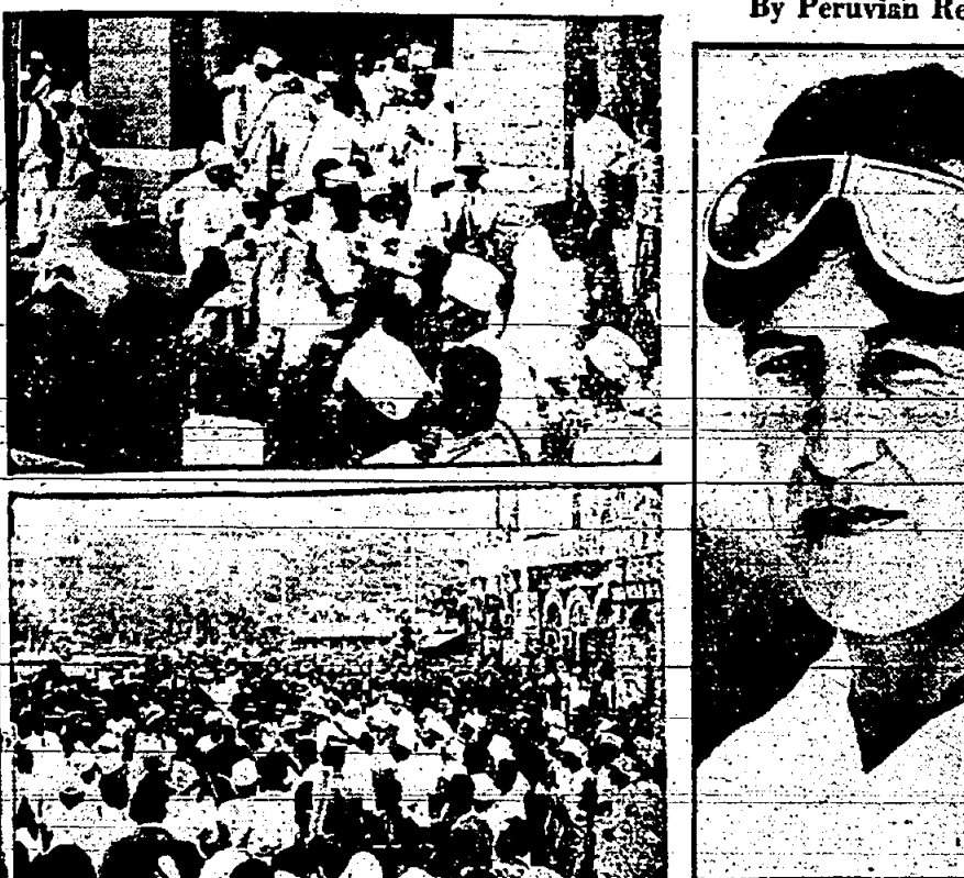
Followers of Mahatma Gandhi, pictured above in arms against the local police, have abandoned their "passive resistance" movement. The remarkable pictures above were made in Bombay by...