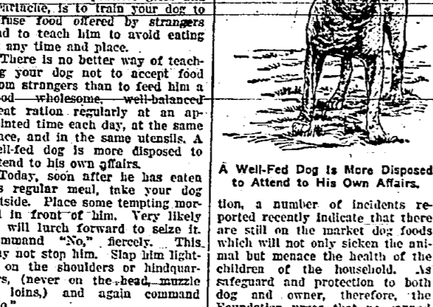
A Well-Fed Dog is More Disposed to Attend to His Own Affairs.

With reports of dog bites in many localities, the Chicago-Kennel-Association has issued a warning to dog owners. It is necessary to train their dogs to eat from their own dishes.