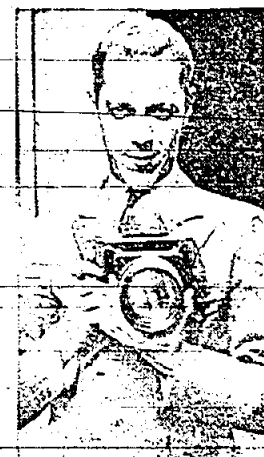
He Serves As Your Eyes

There are those who, through the coming years, will follow closely the course of The Record. There are those who will open its pages but seldom. But to all a word of personal address from the new publisher is due.