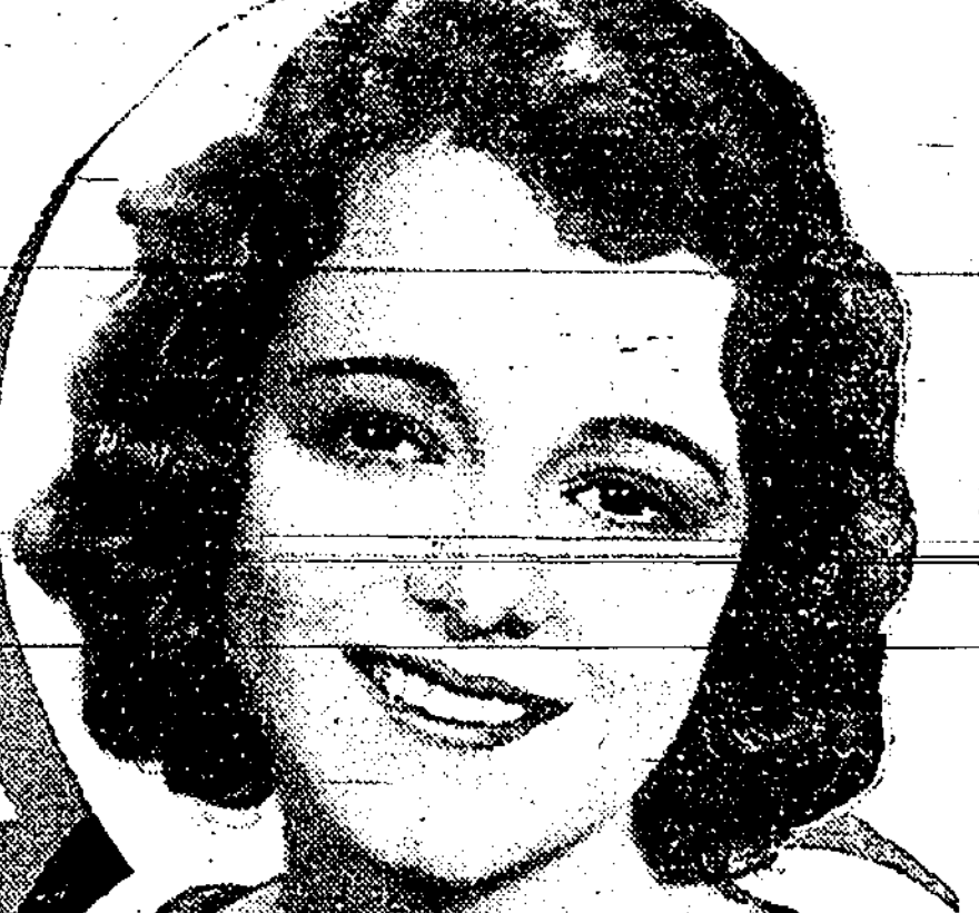
Popular screen actress, plays characteristic role in photoplay in which she is costarred with Charles Farrell.

Popular screen actress, plays characteristic role in photoplay in which she is costarred with Charles Farrell. The play is a masterpiece of historical fiction, and the production is a triumph of scenic art.