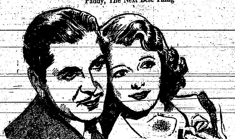
"Paddy, The Next Best Thing"

"Paddy, The Next Best Thing" Comes to the Railway Joint action will appear in one of the most delightful comedies of the season, "Paddy, The Next Best Thing," which will be shown at the Liberty Theatre, tomorrow night. The picture is a comedy of the "Paddy" type, and is a very good one. It is a comedy of the "Paddy" type, and is a very good one. It is a comedy of the "Paddy" type, and is a very good one.