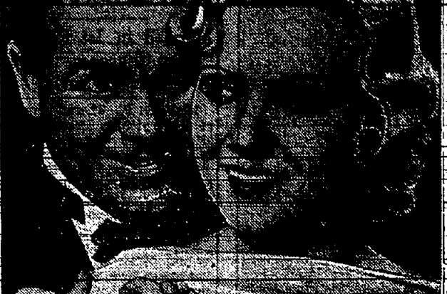
Regis Toomey and Anita Page in "Soldiers of the Storm" which opens at the Railway Theatre tomorrow for two days.