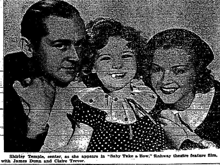
Shirley Temple, center, as she appears in "Baby Take a Bow" Rahway theatre feature film, with James Dunn and Claire Trevor.