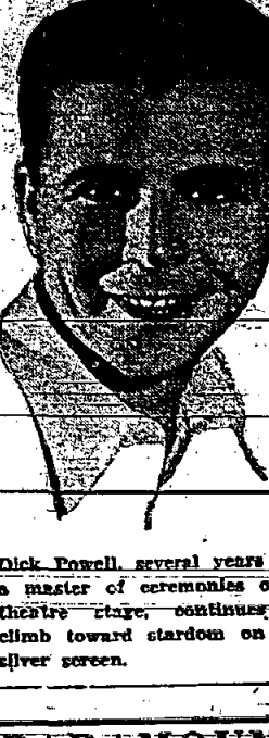
Dick Powell, several years ago a master of ceremonies on a "Dixie" circuit, continues to climb toward stardom on the silver screen.

PARAMOUNT GALA PRESENTATION FRIDAY "CLEOPATRA" with Claudette Colbert, George Raft, and others. 5-816 ACTS-5