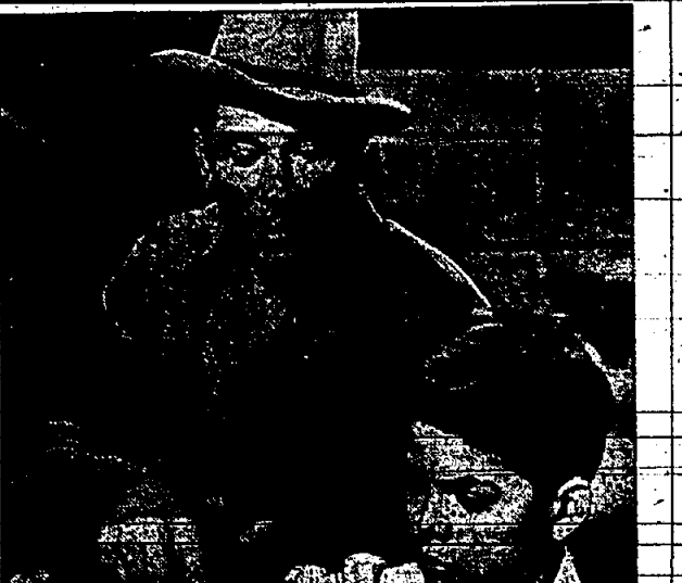
"Brother Rat" featuring Wayne Morris in the leading role at the Regent Theatre.