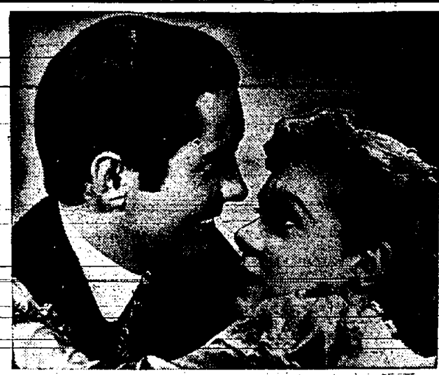
Tyrone Power and Alice Faye are shown above in a scene from "In Old Chicago," dramatic film which returns by popular request to the Empire Theatre tonight.