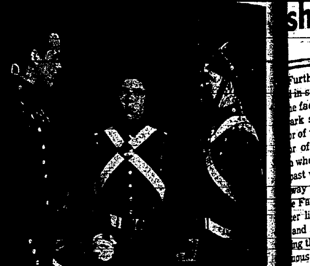
"Brother Rat" featuring Wayne Morris in the leading role at the Regent Theatre.