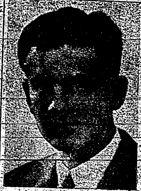
Clifford P. Case