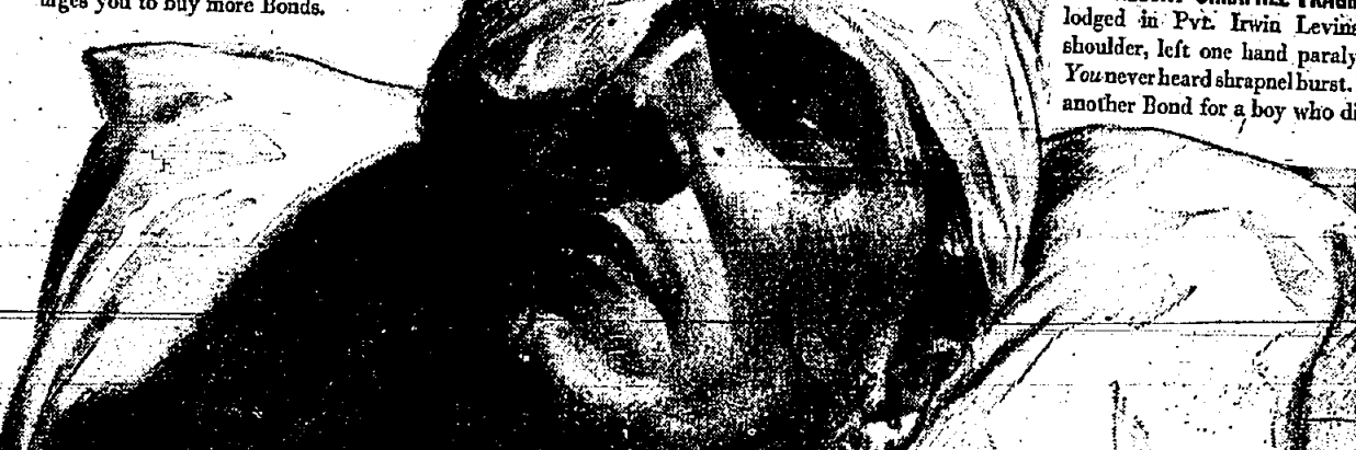
COULD YOU SMILE AFTER LOSING your right eye from a shrapnel bullet, and having a compound fracture of your left leg? Sgt. Carl Funk, of Cincinnati, can not only smile, but is going to carry on in a munitions factory. It's up to you now. Buy War Bonds!