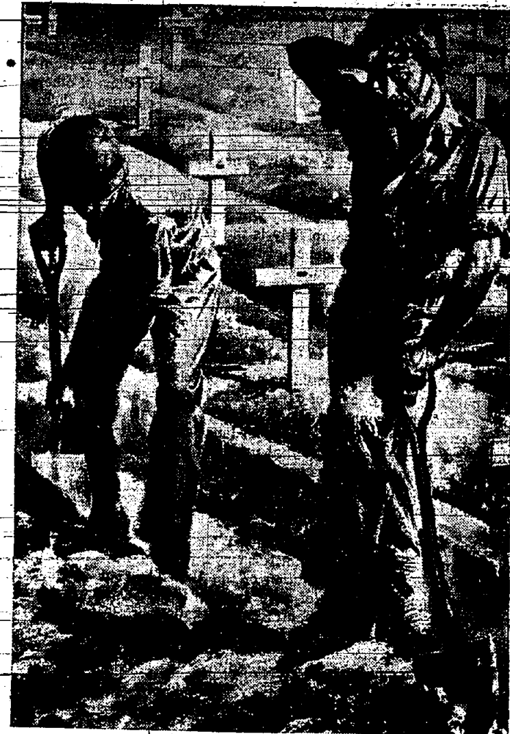
"... Ask those who bury our dead."

THEY KNOW. Every G. I. Joe knows. "This is the big show. This is the pay-off. This is the one that counts." "Sure, we're going to take 'em. But it's going to cost us plenty... thousands and thousands of lives