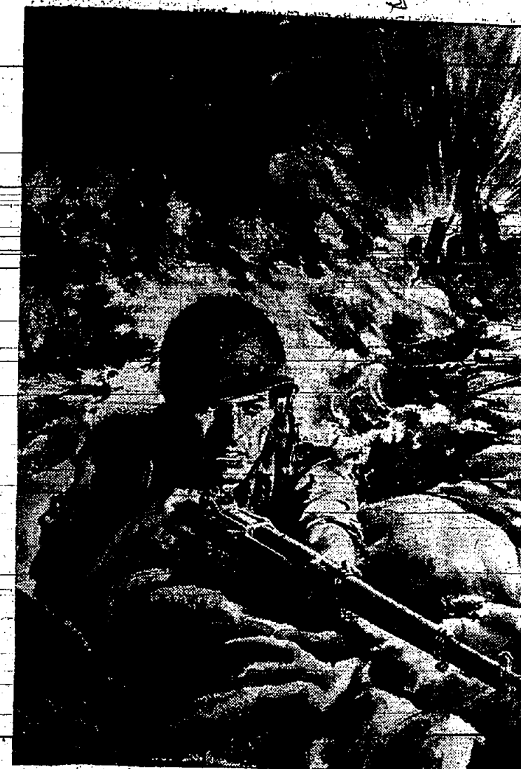
"... Ask the Joes in the front lines!"