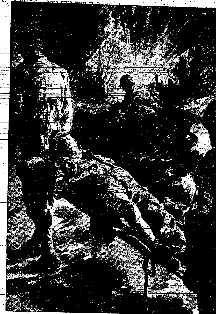
"... Ask that kid on the stretcher!"