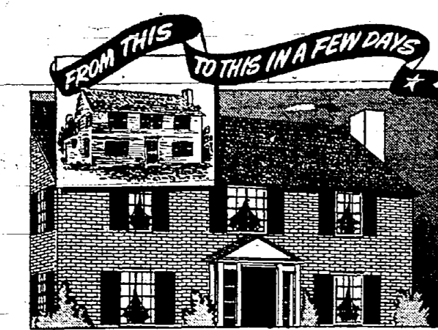
WITH THE NEW MIRACLE OF MODERNIZATION! BIRD Siding

MAIN and MILTON SERVICE STATION... 78721