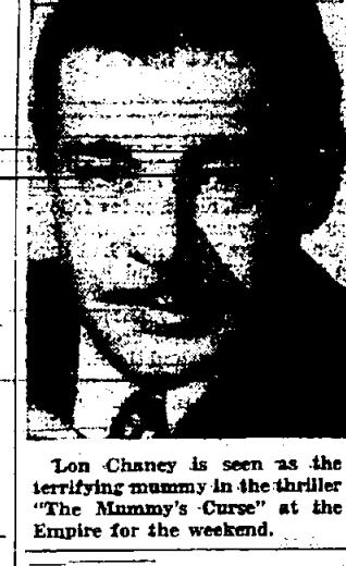
Lon Chaney is seen as the terrifying mummy in the thriller "The Mummy's Curse" at the Empire Theatre.