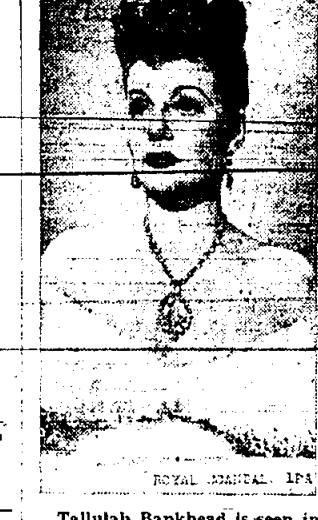
Talulah Bankhead is seen in the title role of "A Royal Scandal" at the amorous and charming Catherine at the Rahway Theatre now to Saturday.