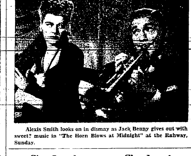
Alexis Smith looks on in dismay as Jack Benny gives out with sweet music in "The Horn Blows at Midnight" at the Rahway Theatre.