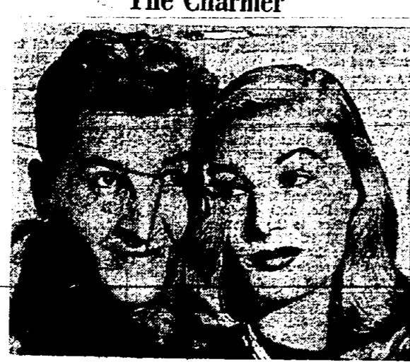
Eddie Bracken and Veronica Lake co-star in "Out of This World" which has been making their debut in the picture arriving Sunday at the Rahway Theatre.