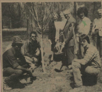
THE WESTFIELD (N.J.) LEADER, THURSDAY, MAY 17, 1984