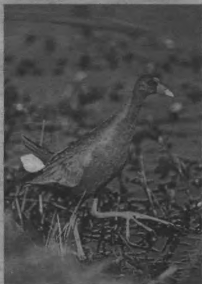
Purple Gallinule.

Other names: blue peter, mud hen, pond chicken, bonnet-walker, purple swamphen (European species) Status: FL = stable, IUCN = LC Length: 14.2-14.6 in. (36-37 cm) Wingspan: 21.7 in. (55 cm) Weight: 7.3-10.2 oz (208-288 g) Life span: to 22 years Nests: in mainland SW Florida Found: All Counties, near coast, mainland Months found: JFmamjjaSOND (lower case indicates nesting season).