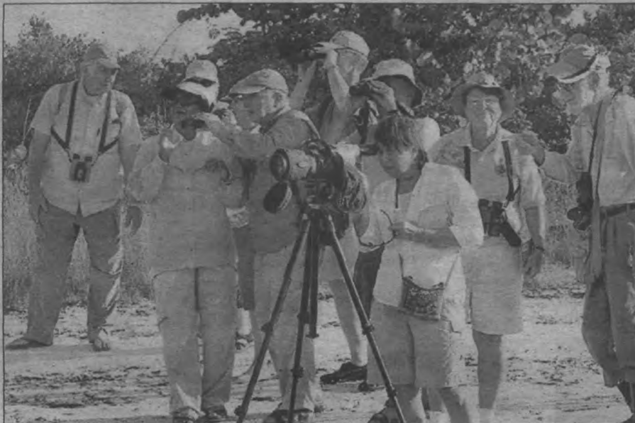
Birders spy on the abundant bird life at Bunche Beach during "Ding" Darling Days.

"Ding" Darling Wildlife Society-Friends of the Refuge sponsors "Ding" Darling Days along with the U.S. Fish & Wildlife Service and Tarpon Bay