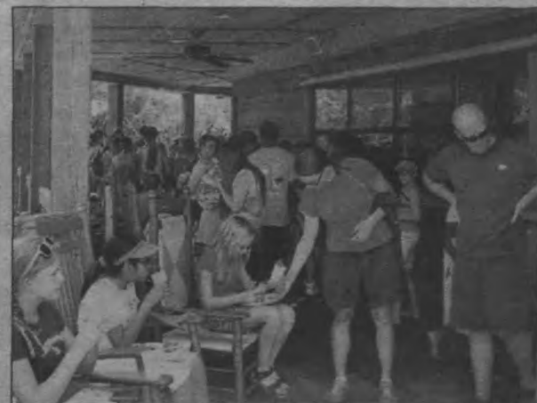
Fifteen students from Canterbury School, along with 48 Lexington Middle School students and eight adults, volunteered their Saturday morning to help clean up Sanibel and Captiva's coastline.