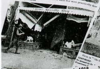
MORGAN EXPLOSION - OCTOBER 4, 1918