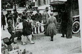
Here we see an injured woman being taken to a hospital.