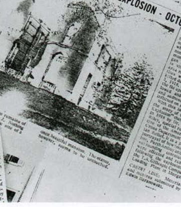
REFUGEES FROM THE MORGAN EXPLOSION - OCTOBER 4, 1918