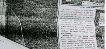
WINDOWS WERE SMASHED IN THE CITY BY BIG BLAST

The explosion caused significant damage to buildings in the city, with many windows shattered. The search for survivors and the care of the injured continued.