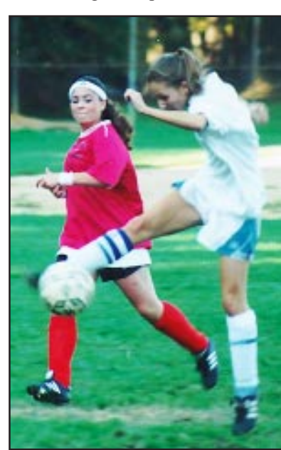
CONSTANT ATTACK... The Blue Devils kept a constant attack on the Elizabeth goal.