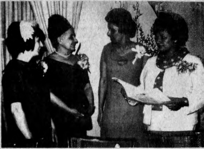
DISCUSSING HER "WOMEN AND THE LAW" speech at recent installation ceremonies of the Colonia Branch of the American Association of University Women...