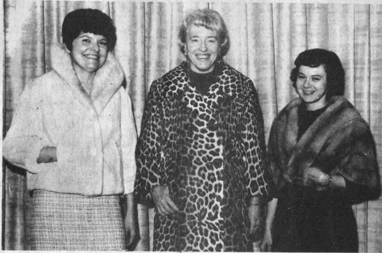
HAPPILY ATTIRED IN GLAMOROUS FURS, members of the Rosary Altar Society, St. Mary's Church, Rahway, N.J., pose in preview to the fur fashion show to be presented by the Flemington Fur Company on April 28 in the gymnasium of the school at 7:30 P.M. during the Society's Annual Dessert Bridge.