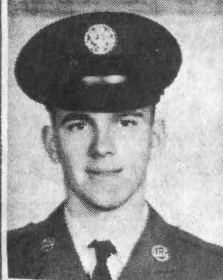
AFB, Miss., as a U.S. Air Force communications specialist.