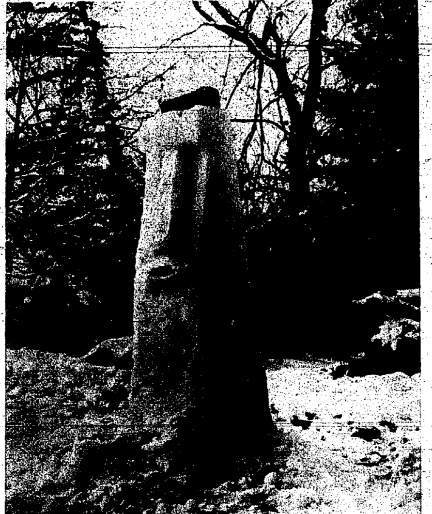
'Easter Island' emerged in snow. In the 1100 block on Orange Avenue.