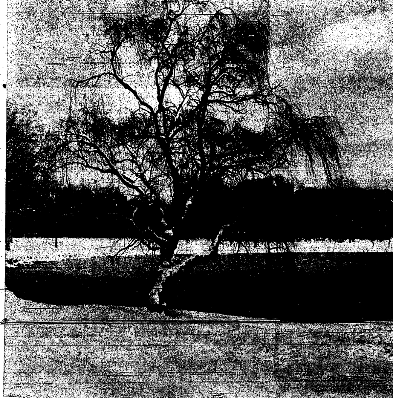
Nomahegan Park, Winter 1983, by Greg Price.

PROBLEM STUDENTS "It is one thing to set up new and creative programs for high school students, but if the students are disruptive or simply do not attend classes, then the problems of education and training will not be solved. There are a number of exciting programs being tested in order to reach such students, and it is imperative that we, too, make a concerted effort in this area."