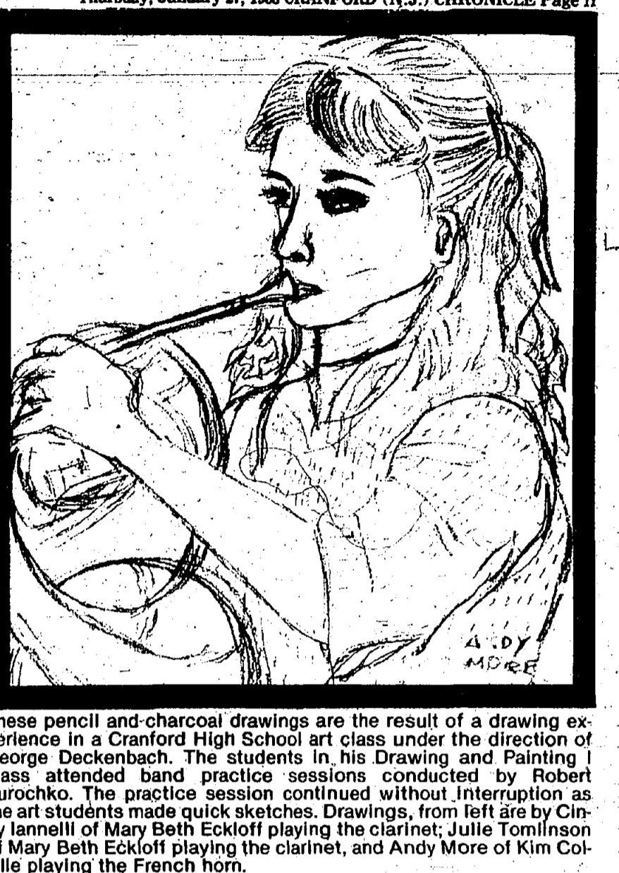
These pencil and charcoal drawings are the result of a drawing experience in a Cranford High School art class under the direction of George Deckenbach.