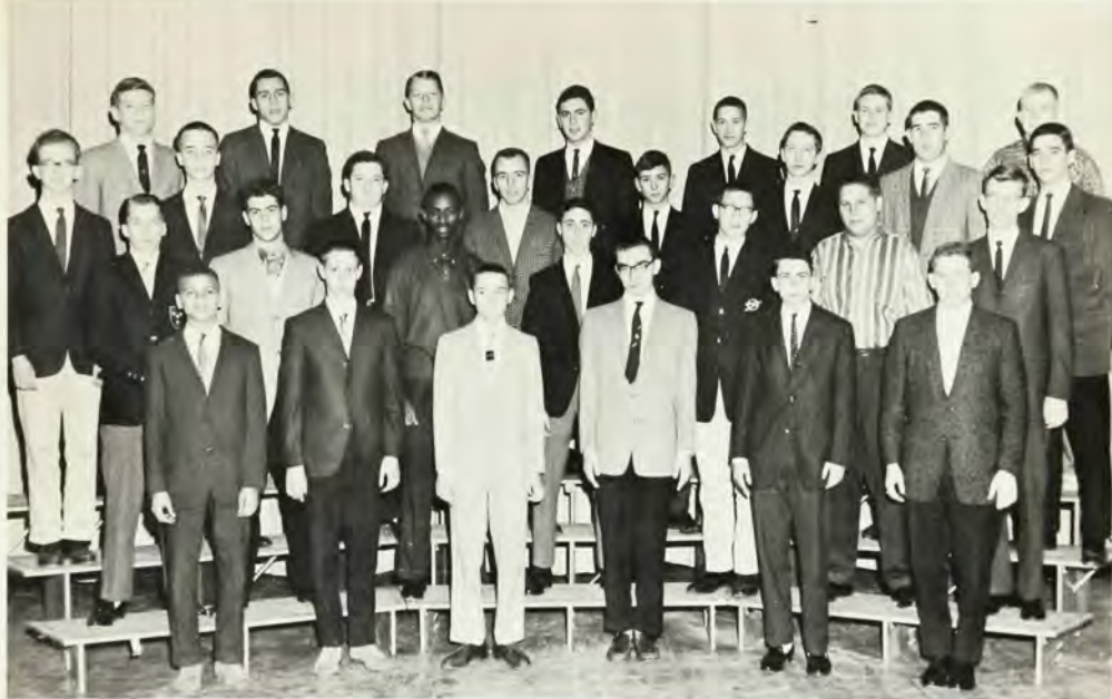
Boys' Glee Club