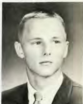
Francis Wallace Collins