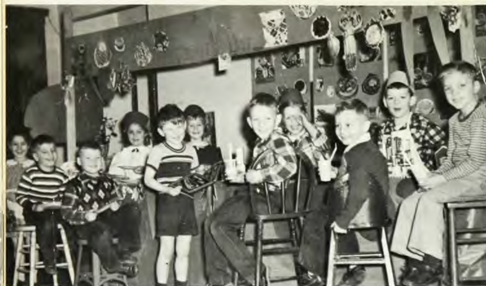
In this kindergarten class at Cleveland School, you will find some of the graduating seniors.