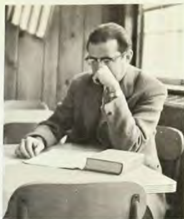
Mr. Drabble proves that it is possible to sleep in the Study Halls.