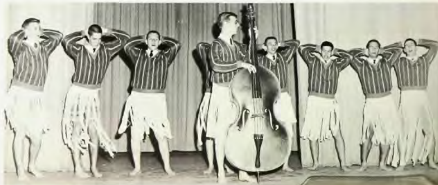
Boys' Double Fifth