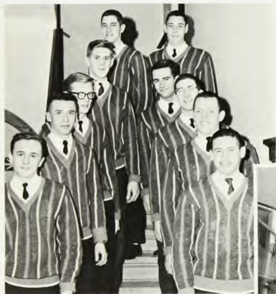
Boys' Double Fifth