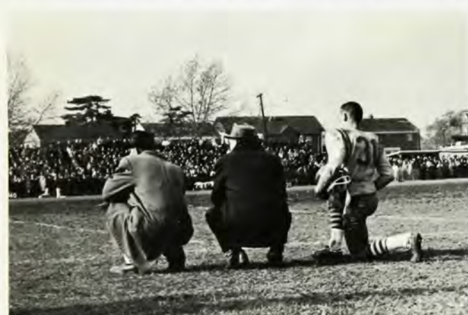
The '62 squat . . . ah er squad.