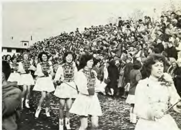
Touchdown at the Jeff game.