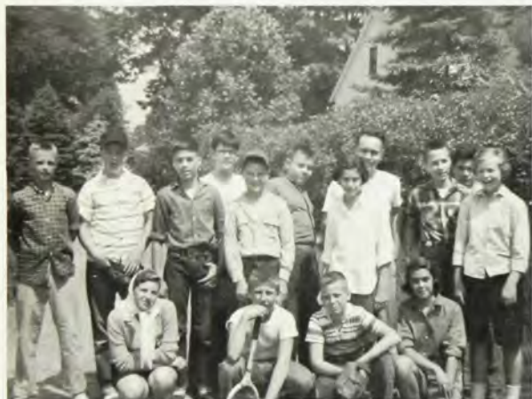
Remember these faces? They were members of the seventh grade class in 1957.