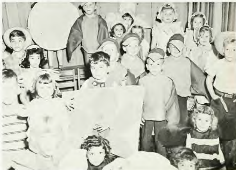
Here at Roosevelt School another kindergarten class performs in the annual play. Many of the stars are in the 1962 graduating class.