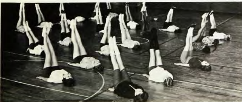
Chorus Line Rehearsal