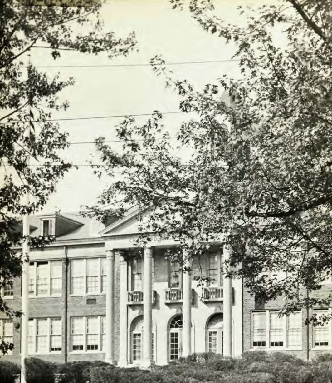
CRANFORD HIGH SCHOOL