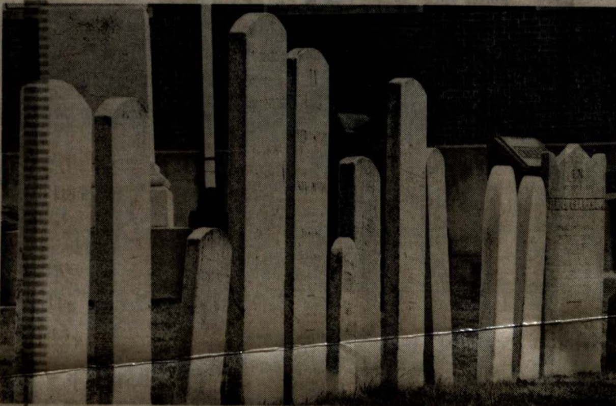
Gravestones stand in testimony to time at Stelton Baptist

"There were a lot of things about the old days that were good," she said. "A lot of good things."