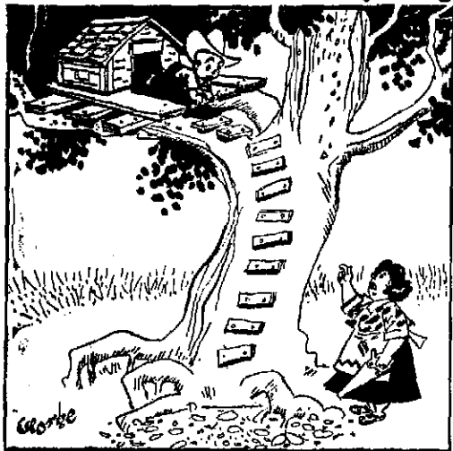
"If you don't come down, mother will bring you down in a hurry!"