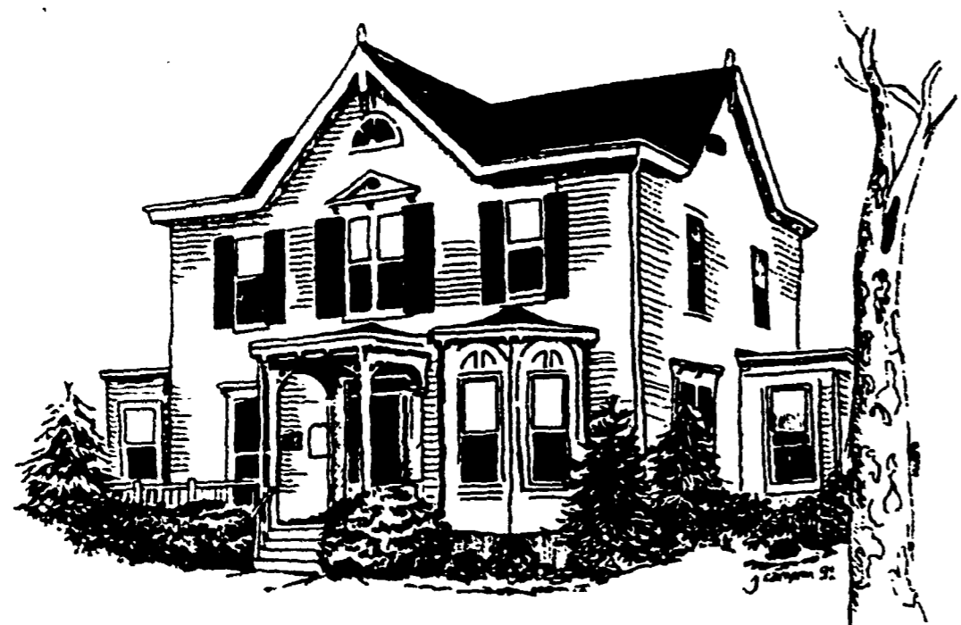
12 Taylor Street - Neighborhood House