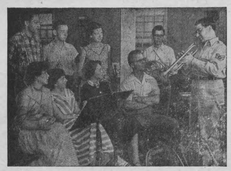
Music is one of common interests bringing together civilian residents of community and GIs from nearby military post in program sponsored by National Recreation Association. NRA is member agency of United Defense Fund which is financed through Community Chests and United Funds.