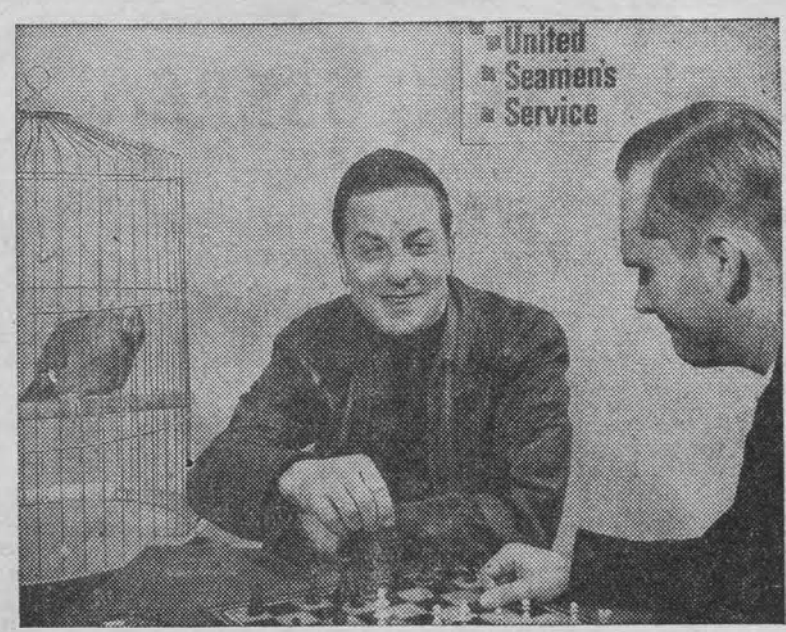
Merchant seamen find recreation in United Seamen's Service clubs in foreign ports. They pay fair prices for services received. USS is financed by United Defense Fund through Community Chests and